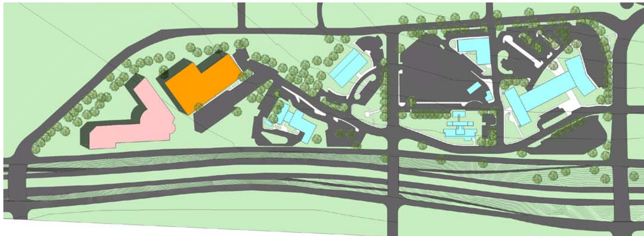
Existing Facilities Proposed 4 Story Civic Center 4 Story Parking Structure

This Option was devised to offer a phased approach to this scenario. In this option, the RMA department would initially remain in its current location at Government Plaza and a smaller facility would be initially constructed as phase 1. In this smaller structure, sufficient infrastructure would be include to allow for future expansion as this structure would be designed to house the staffing needs of the County, projected to 2016. In 2016, a new adjacent facility/ expansion would the be constructed to house all departments, including RMA, until 2026. While this phased approach offers a lower initial cost, the complete construction cost for all phases will be greater due to cost escalations.