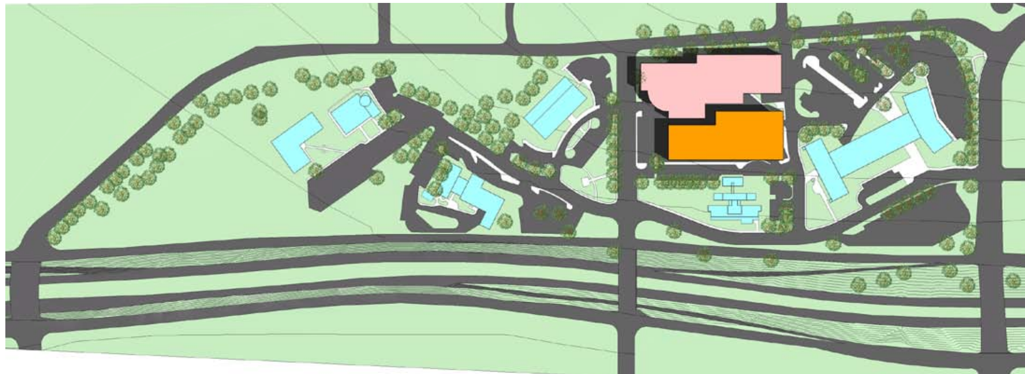
Existing Facilities Proposed 4 Story Civic Center 4 Story Parking Structure

This Option was devised to offer a phased approach to this scenario. In this option, the RMA department would initially remain in its current location at Government Plaza and a smaller facility would be initially constructed as phase 1. In this smaller structure, sufficient infrastructure would be include to allow for future expansion as this structure would be designed to house the staffing needs of the County, projected to 2016. In 2016, a new adjacent facility/ expansion would the be constructed to house all departments, including RMA, until 2026. While this phased approach offers a lower initial cost, the complete construction cost for all phases will be greater due to cost escalations.